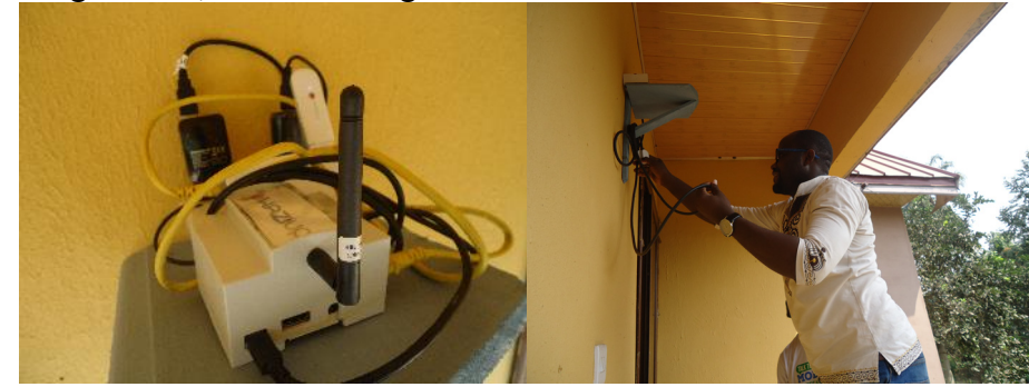
Figure 2: Deployed gateway in the office of Kumah Farms, 300m far away from the device

A low-cost gateway was installed at the entry of the farm with a 3G USB dongle (see Figure 2). The distance from the pond to the gateway is about 200m with many obstructions: vegetations, other buildings.