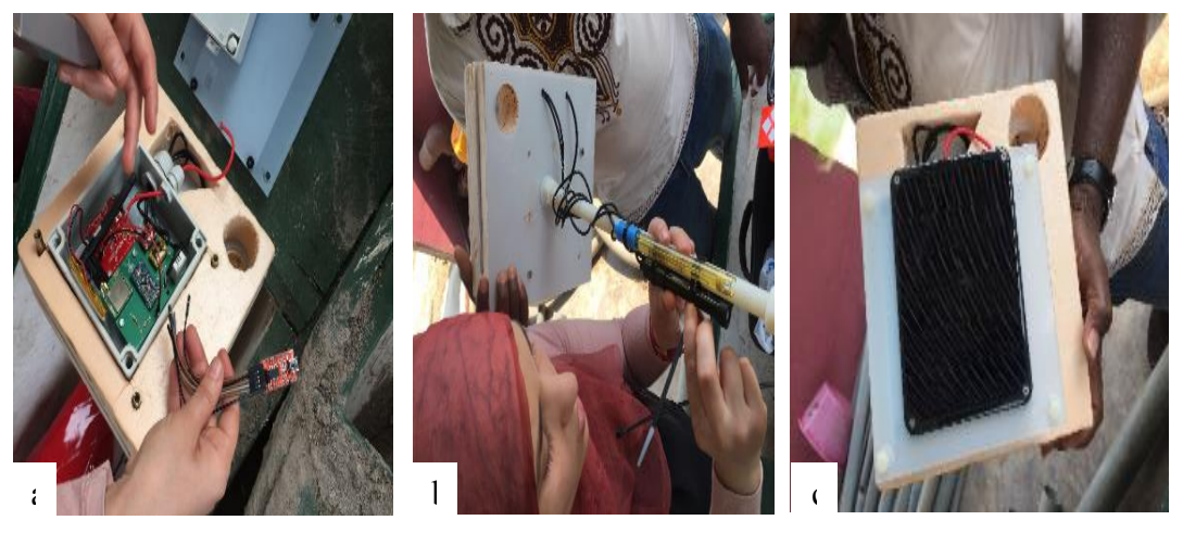
Figure 1: Assembling of the device part on site. (a) Electronic parts in a sealed waterproof box. (b) Sensors along a tube. (c) Solar panel on the top of the device.

On January 2017, we deployed the device on Kumah Farms, in Kumasi, Ghana. This farm has 18 ponds of various size, from 120m^2 to 0.8 hectares. They grow Tilapia and Catfish, which has a life cycle of 6-8 months before being harvested. After designing the prototype and assembling the electronic parts in France, the prototype was finally assembled on site with help of African local partners and potential final users as illustrated in Figure 1.